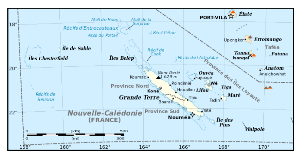
Figure 1 - Map of New Caledonia and Vanuatu

from that of an overseas territory to a special collectivity of France. The transfer of power from metropolitan France to New Caledonia is ongoing.